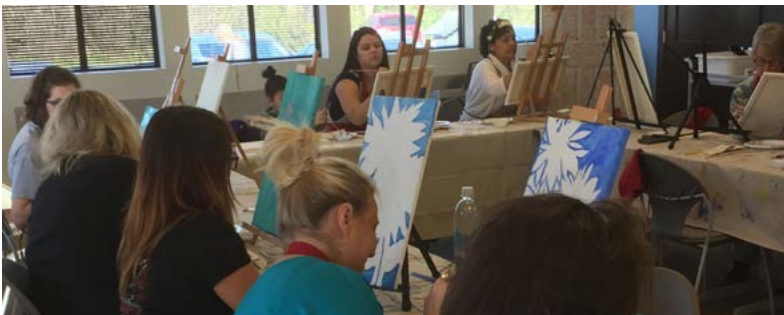
"Sunflowers & Support" painting gathering

On Give to the Max Day , we were able to raise over $20,000 and we also had a very good End of the Year Giving Campaign , which brought in an additional $40,000 to support our mission. Thanks to all of you who gave on Rein in Sarcoma's behalf.