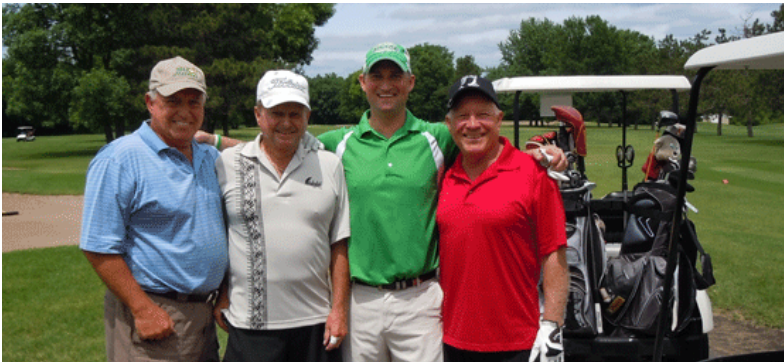
Richard Berqual Memorial Golf Tournament