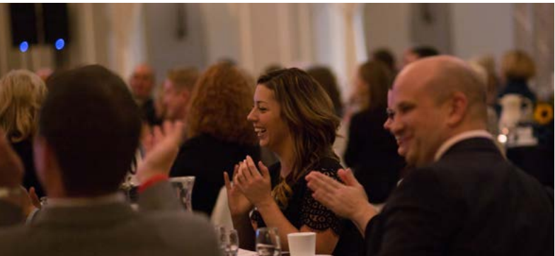
Fall Fundraiser "Let's Change the Story"