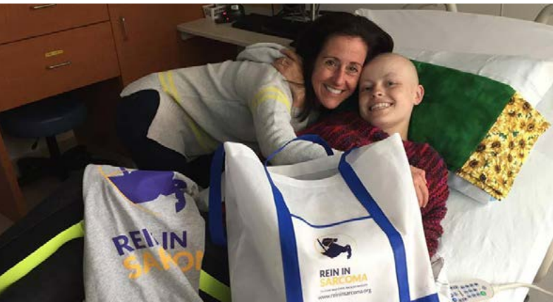
Tote bags by the Patient & Family Support Committee