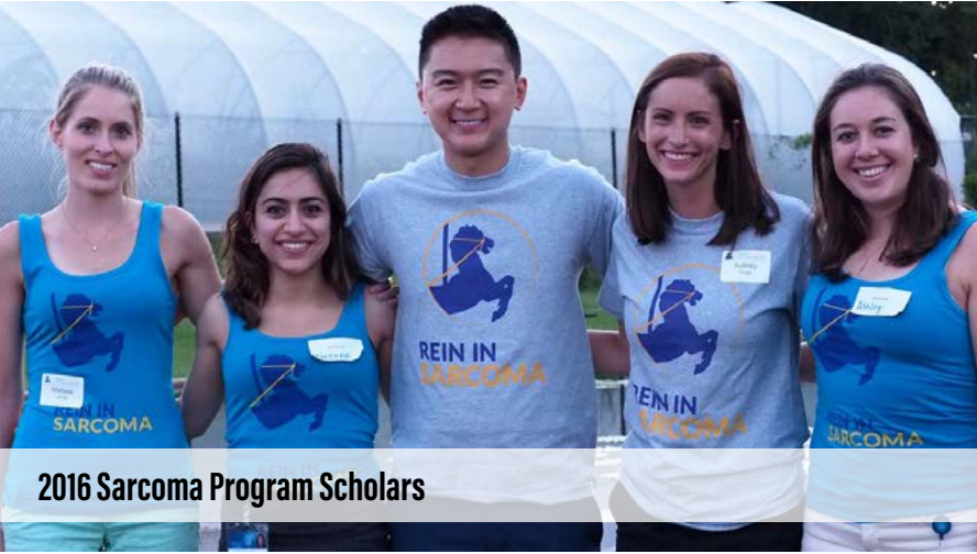
2016 Sarcoma Program Scholars