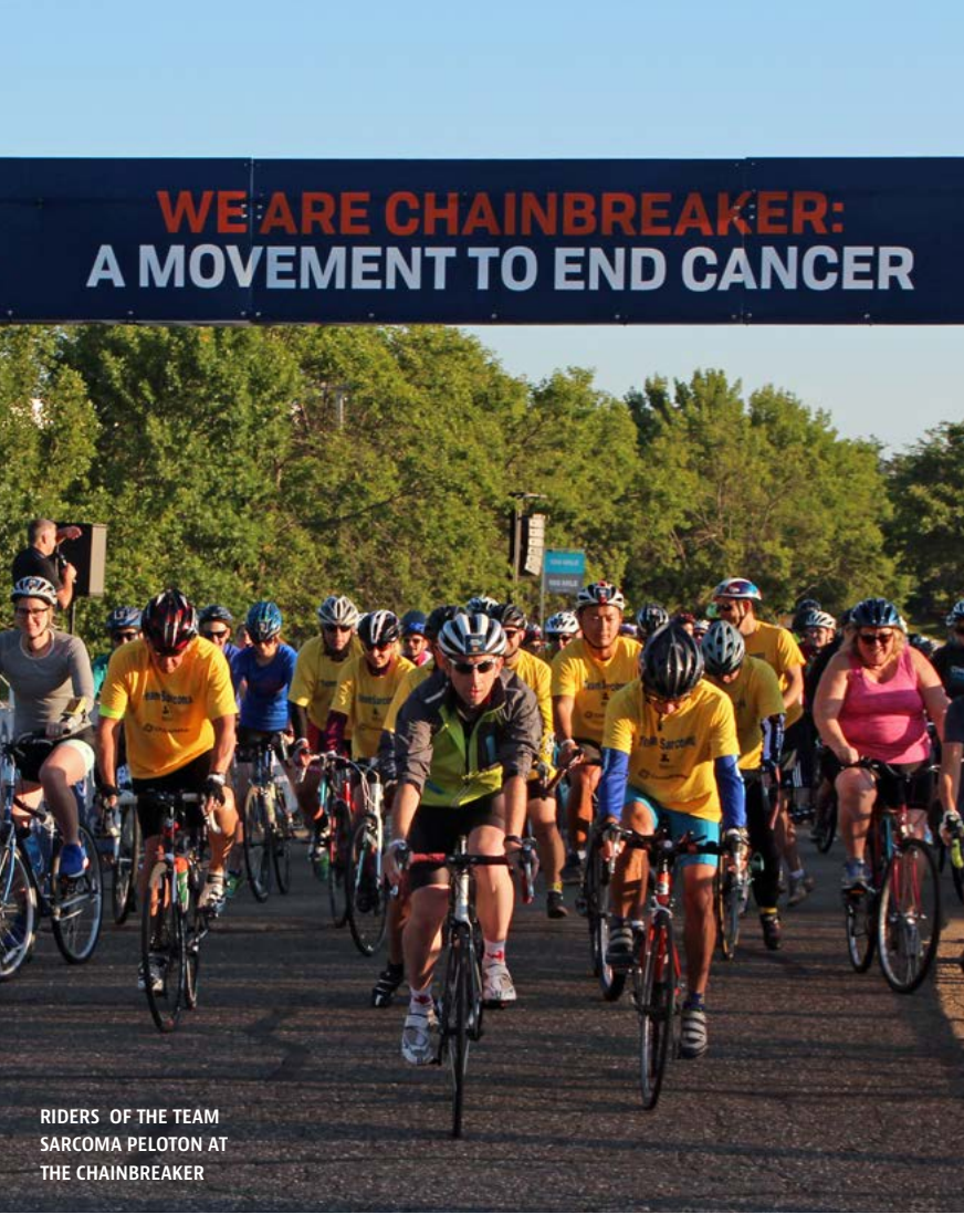
RIDERS OF THE TEAM SARCOMA PELOTON AT THE CHAINBREAKER

We support sarcoma patients and survivors in a variety of ways. Our events provide opportunities to meet other people whose lives have been touched by sarcoma. Our in-person and on-line support groups are another great way to connect, find information, and be part of a larger sarcoma community. While unable to erase the devastating effects of sarcoma, building relationships can lighten the load as empathy is shared.