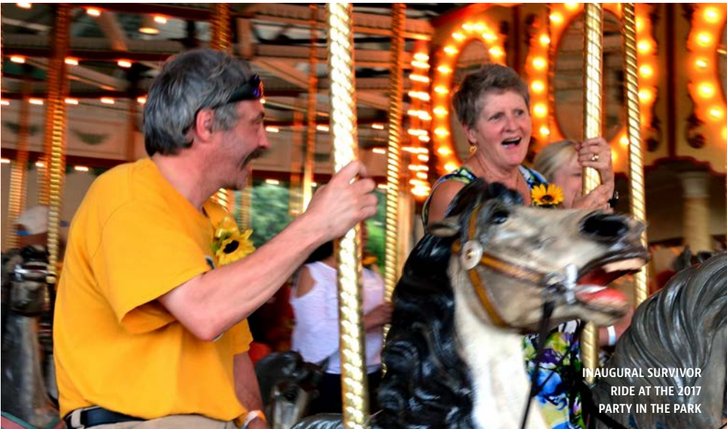
INAUGURAL SURVIVOR RIDE AT THE 2017 PARTY IN THE PARK

Thank you to all who joined us at the Deer Run Golf Club for a wonderful day of golf and fellowship in support of our mission! We had 22 teams participate in our first RIS annual Golf Tournament and together we raised over $28,000.