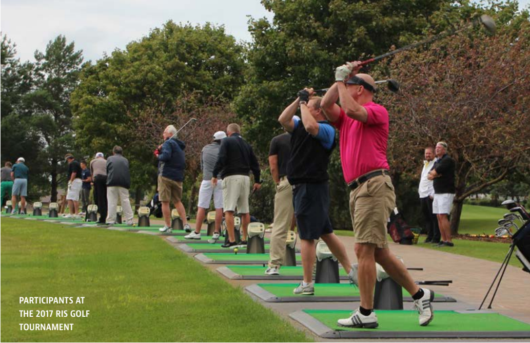
PARTICIPANTS AT THE 2017 RIS GOLF TOURNAMENT

Over 400 patients, survivors, loved ones, and those who have lost a loved one to sarcoma attended the 2017 Sarcoma Family Picnic. Attendees socialized with doctors and researchers from the University of Minnesota, Mayo Clinic, and Children’s Hospitals and Clinics of Minnesota. New connections were made among a community joined together by a personal connection to sarcoma.