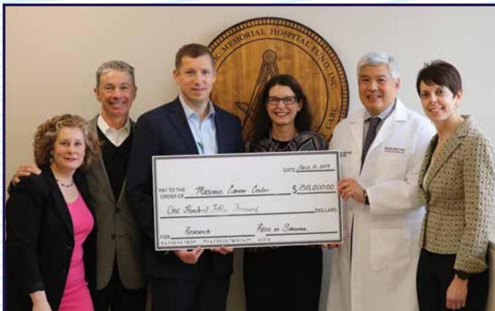
RIS MCC Funding Research Impact